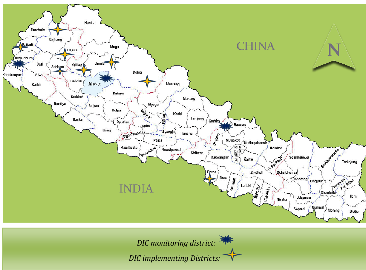
Figure 1 DIC focus districts