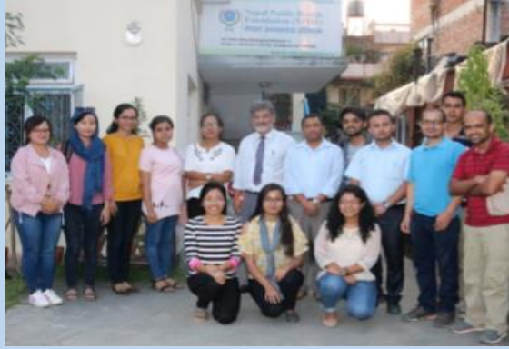
International Centre for Diarrhoeal Disease Research (icddr), Bangladesh team visited NPHF on July 10-11, 2017